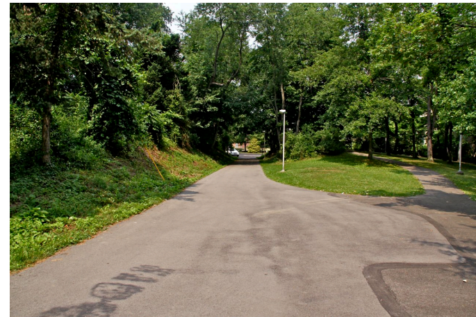
Location: Wiltshire Park Upper St. Clair, just southwest of former Drake Trestle.

Note hillside (left of photo), downslope (right of photo)