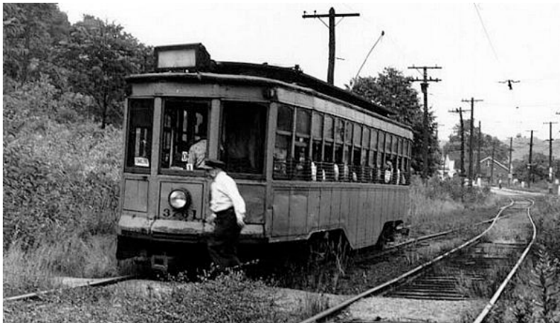
Caption from davesrailpix.com: "3761 on fantrip on Washington interurban line, 1940s. Bill Volkmer collection"

My photo was taken here, Looking northeast (north is up)